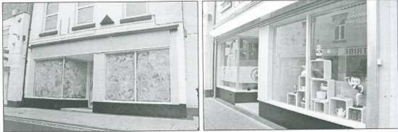
Crystal's Cup Cakes - before and after

Dannyp@greatdawley.com or 01952 567914 or drop in to our office.