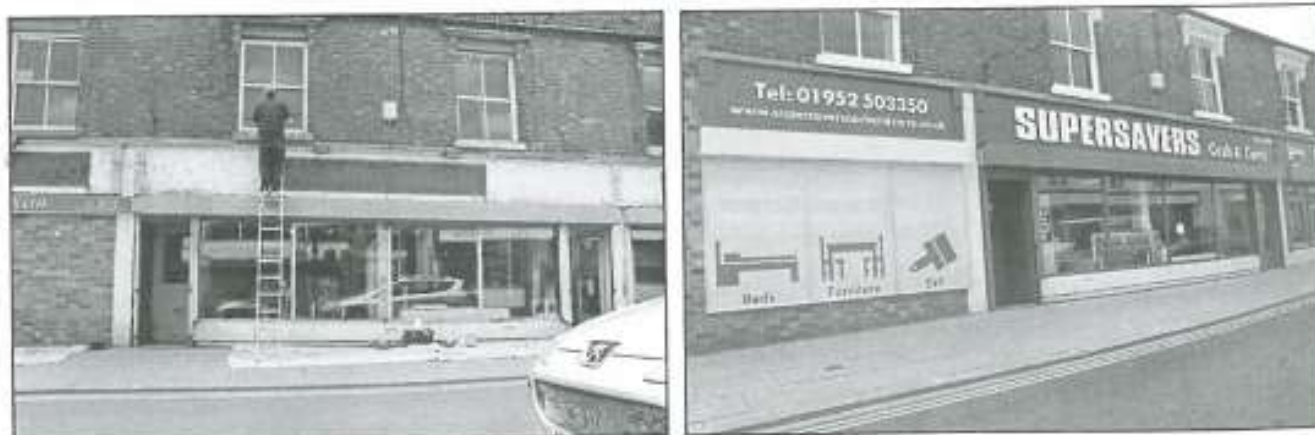
Supersavers - before and after

'With escalating costs of setting up a new business, the £250 grant really helped with paint and decoration costs.'