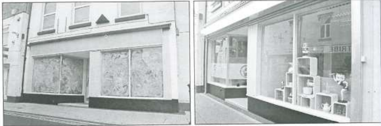
Crystal's Cup Cakes - before and after

Dannyp@greatdawley.com or 01952 567914 or drop in to our office.