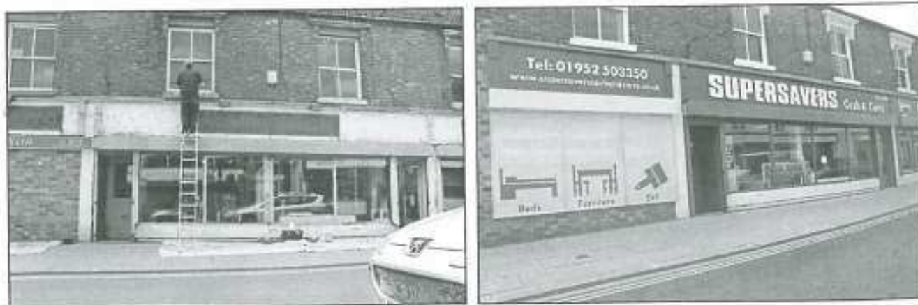
Supersavers - before and after

'With escalating costs of setting up a new business, the £250 grant really helped with paint and decoration costs.'