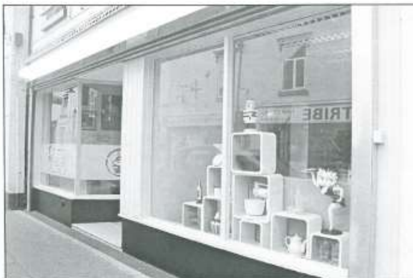
Crystals Cupcakes is a new shop in Dawley High Street and has used the grant to contribute towards the renovation works.