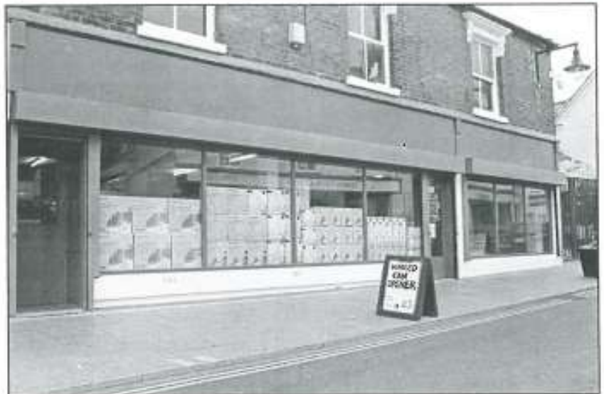
Supersavers Cash & Carry have used their grant towards painting the frontage of the shop.