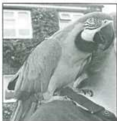
Dawley Bank Day